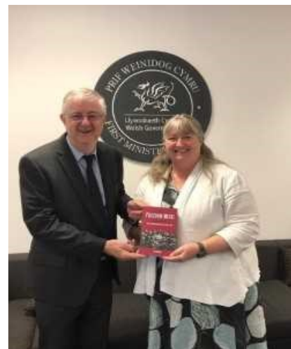
First Minister Mark Drakeford receives a copy from Julie James AM.