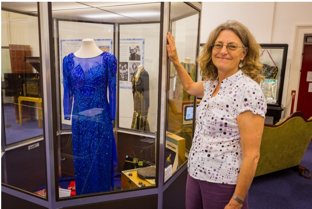
Photo © Jazz Heritage Wales / Deb Checkland Chair of Trustees with Dame Cleo Laine's "Carnegie Hall" gown worn for the 25 th anniversary of her concert there in 1974.

The Jazz Heritage Wales Archive Collection has been catalogued and is available at the National Library of Wales, Aberystwyth. Here is the link: https://archives.library.wales/index.php/jazz-heritage-wales-archive-archif-menywod-cymru-womens-archive-of-wales The title is Jazz Heritage Wales Archive (Archif Menywod Cymru/Women's Archive of Wales).