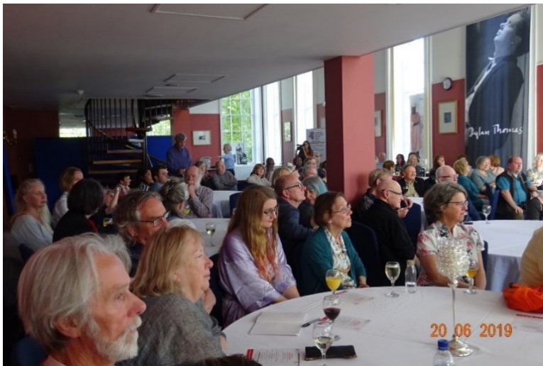
A large crowd enjoyed the words and music at the launch