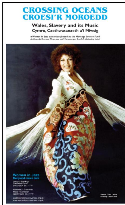
Dame Cleo Laine (Patron)